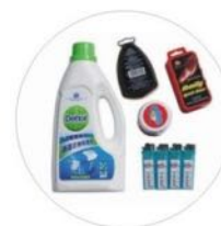
SY300 全自动平面贴标机 AUTOMATIC FLAT BOTTLE LABELING MACHINE