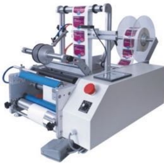
SY-190 半自动圆瓶贴标机 SEMI AUTO ROUND BOTTLE LABELING MACHINE