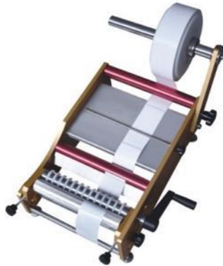
SY-30 手摇贴标机 HAND LABELING MACHINE