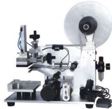
SY-60 平面贴标机 FLATTENING MACHINE