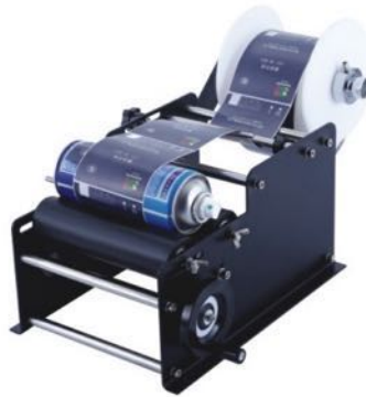
手摇贴标机 HAND LABELING MACHINE