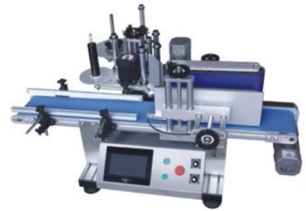
SY-150 桌面型全自动圆瓶贴标机 DESKTOP AUTO ROUND BOTTLE LABELING MACHINE