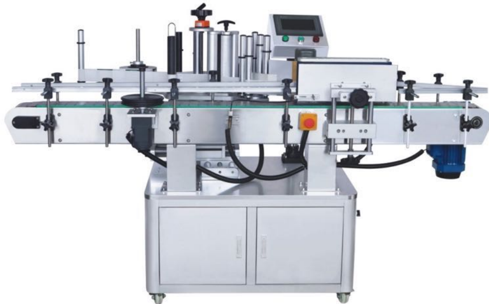
SY-220-A 全自动圆瓶贴标机 AUTOMATIC ROUND BOTTLE LABELING MACHINE