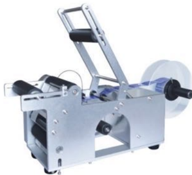
SY-50 圆瓶贴标机 ROUND BOTTLE LABEL MACHINE