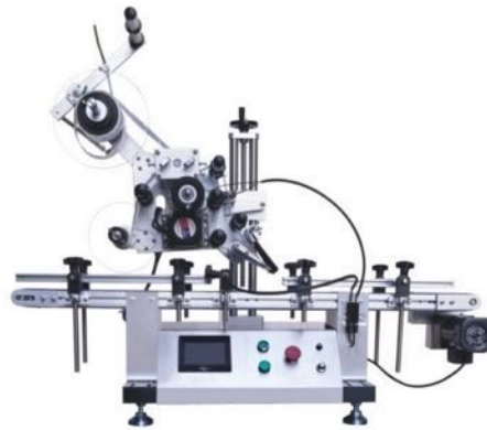
SY-160 桌面型全自动平面贴标机 DESKTOP AUTO FLAT LABELING MACHINE