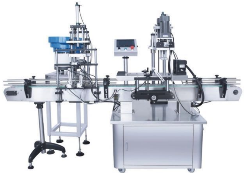
全自动搓盖机+落盖机 FULLY AUTOMATIC CAPPING MACHINE + AUTO CAP FEEDER