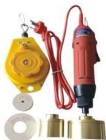
手持式电动旋盖机 HANDHELD ELECTRIC CAPPING MACHINE