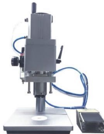
手钳式西林瓶压盖机 PLIERS TYPE VIAL CAPPING MACHINE