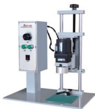
DDX-450型 电动台式旋盖机 DESKTOP ELECTRIC CAPPING MACHINE