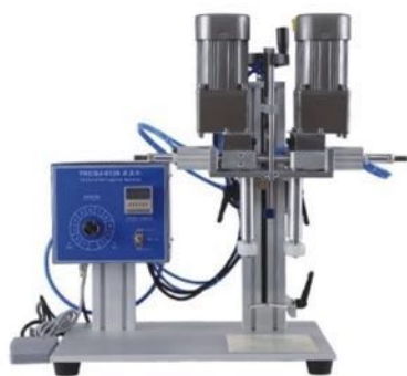
YKCGJ-6120 桌上型锁盖机 DESKTOP CAPPING MACHINE