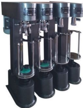
SK-40锁盖机 CAPPING MACHINE