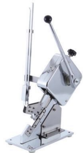
U型打扣机 U-SHAPED DEDUCTION MACHINE