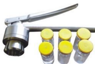
手钳封口机 PLIERS SEALING MACHINE