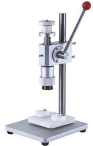
LTX-50 手动扎口机 MANUAL JAW MACHINE