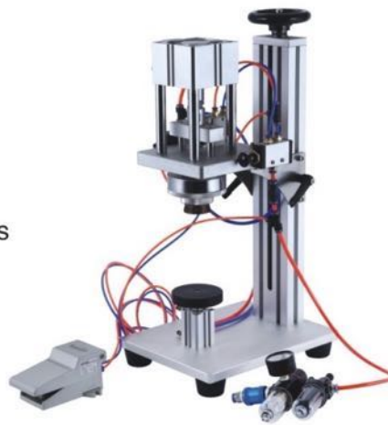
LTX-80 气动香水扎口机 PNEUMATIC PERFUME ZHAKOU