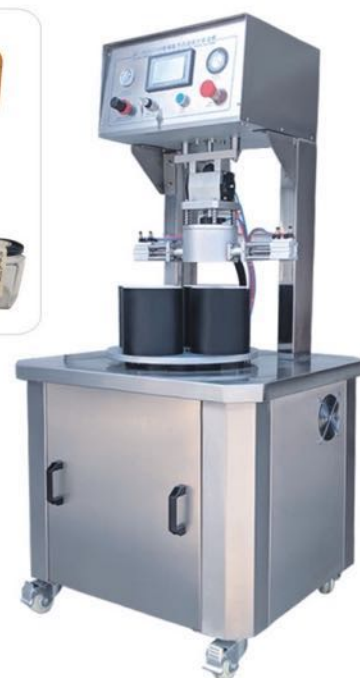
真空旋盖机 VACUUM CAPPING MACHINE