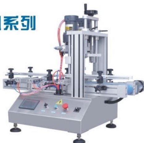
桌面搓盖机A款 DESKTOP RUBBING MACHINE A