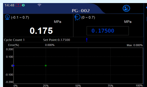
Pressure gauge / transmitter / switch calibration