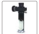
measuring microscope (included)