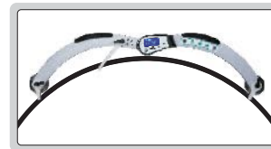
external diameter measurement