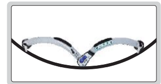
internal diameter measurement