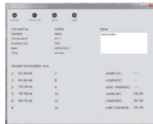
software (included), data output, save and print