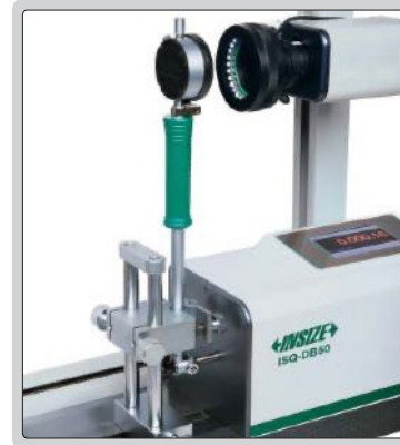
check bore gages