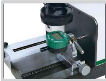
check digital indicators (detect digits on screen)