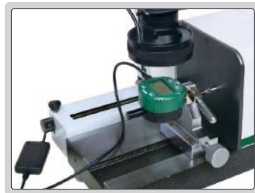
check INSIZE digital indicators (connection with cable)