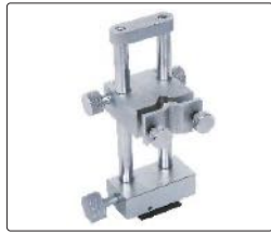
Ø4-28mm holder for bore gages (included)