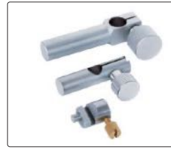
Ø4mm, Ø6mm and Ø8mm holder for dial test indicators (included)