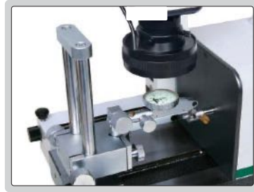
check dial test indicators