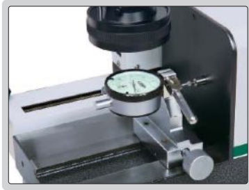
check dial indicators