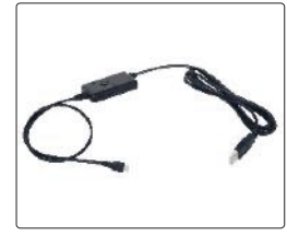
cable for INSIZE digital indicators (optional)