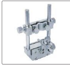
holder for split type bore gages (optional)