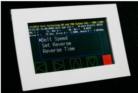
Belt Speed and Reversing Options