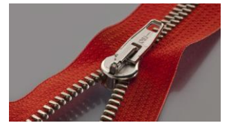
Approved metal trim

Finding the right metal: ‘Phase-detection’ signal processing techniques enable machine software to distinguish between different types of metal. This means it is able to detect small fragments of broken needles whilst ignoring other metals including non-ferrous zippers, studs and accessories.