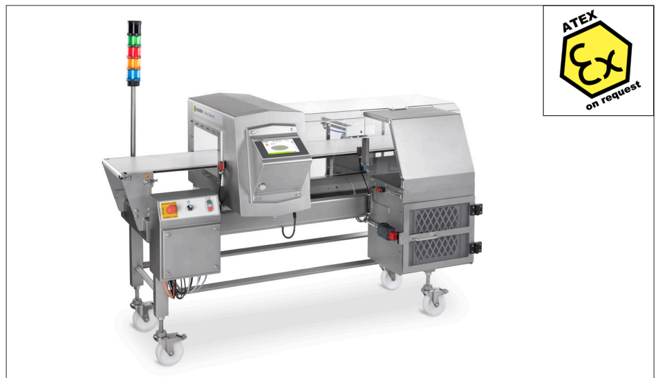
UNICON+ with INTUITY metal detector and Higher Level Security option

UNICON+ metal detection systems detect all ferrous and non-ferrous metals (steel, stainless steel, aluminium etc), even those which may be contained in the product. It is used for inspecting packaged and unpackaged items.