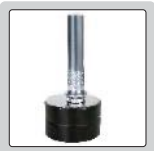
test flat surfaces (with the cover)

Application: 1. For steel material 2. Test surface hardening layers (carburized, nitriding, high frequency hardened, etc.) 3. Suitable for arc and conical surface 4. Suitable for small or light workpieces 5. Test large workpieces at any direction 6. Suitable for rough surfaces