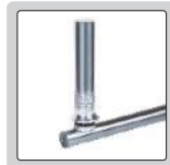
test cylinder surfaces (use V-groove on the cover)