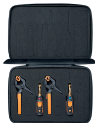
AC & Refrigeration Kit: 0563 0002 20