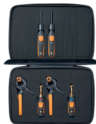
AC/R Test & Load Kit: 0563 0009