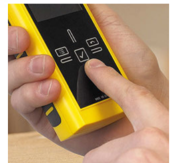
The T510 comes with a continuous surface made of highly scratch-resistant Blanview special glass and capacitive touchscreen control panel.

During measurement, the wood moisture value determined in real time and the defined wood temperature are simultaneously indicated on the clearly legible colour display behind Blanview special glass, ensuring a high-contrast display of measured values even in the sunlight.