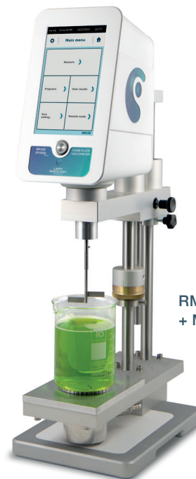
RM 100 CP 1000 + MS-KREBS

MS CP (p80), MS-RV (p75)*, MS-VANES (p77)*, MS-KREBS (p77)*, (* with adaptor Ref. 800146).