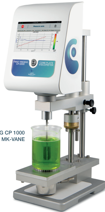
FIRST PRODIG CP 1000 + MK-VANE