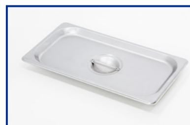
Stainless steel lid for all models