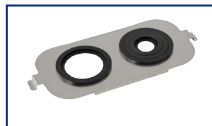
Becker support for DU-45 and DU-65 - AU-65