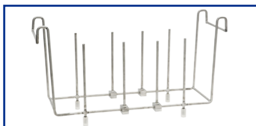
SS-200 sieve holder only for AU-450

* All becker support include black plastic adapter diameter: 91,7 - 72,0 - 52,0 - 32,5