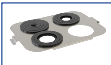
Becker support for DU-100