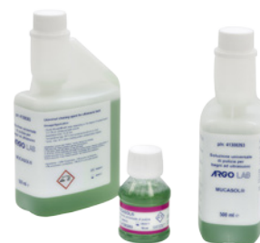
Universal cleaner solution for all model