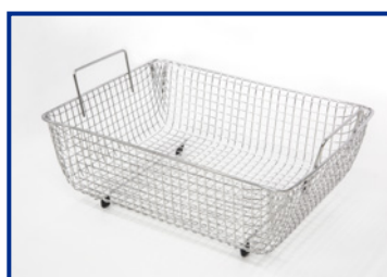
Mesh basket for all models