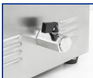
Emptying valve for DU-100 and AU-450