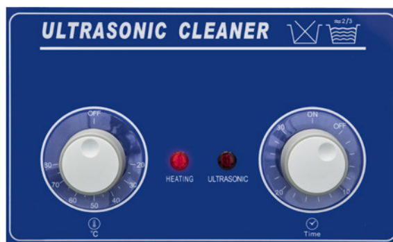
Front panel of AU series