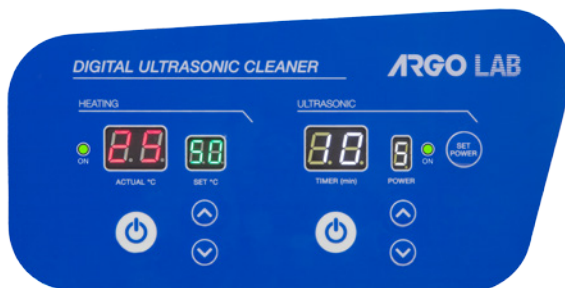
Front panel of DU series

All models are provided with a stainless steel mesh basket, stainless steel lid and 1x 60 ml concentrate universal cleaner solution