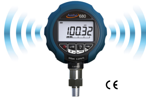
680 with data logging and wireless (optional)