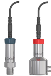
Gauge pressure Differential pressure