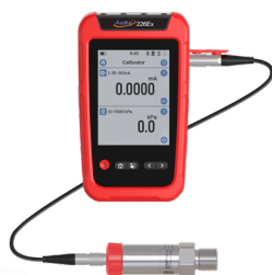
Additel 226Ex with ADT161Ex Pressure Module

Note: Precision Sensors (APXR) cannot be configured as an Ex model and cannot be read by Ex device.