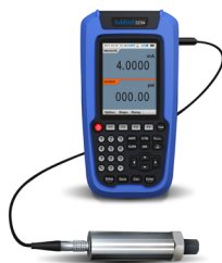
Additel 223A with ADT160A Pressure Module