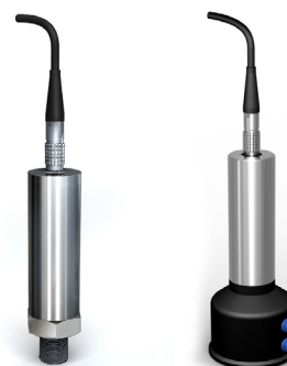
Gauge pressure Differential pressure