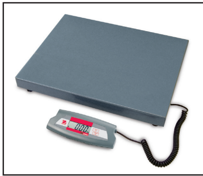
75kg and 200kg models available with large platform