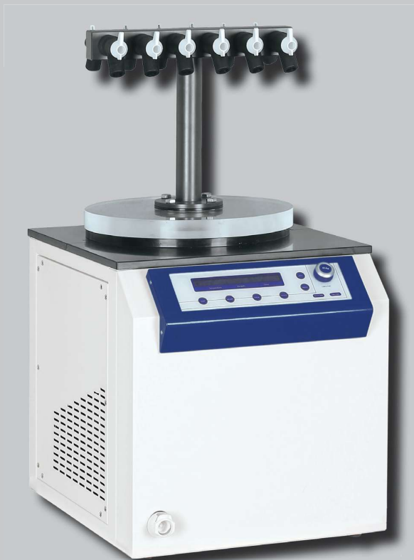
FD-8 with 12 port T-type manifold (not included)

-60° down to -90°C, many accessories available