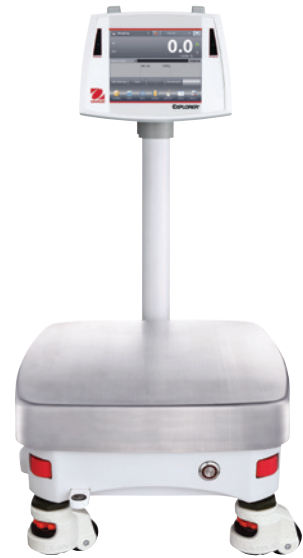
Shown with optional tower mount and rolling feet